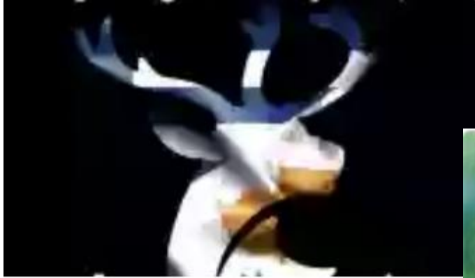
Greek and Cypriot Society